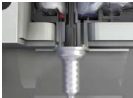
Fig. 7: Principle of the PentaMatic bag self-opening mechanism

With the PentaMatic it is therefore no longer necessary to cut the foil bags open by hand. The PentaMatic design integrates the cartridge cover into the foil bag thereby eliminating the risk of user errors during opening, which greatly enhances the safety of the system. The PentaMatic thus represents a major step towards better hygiene and more economical working procedures in the dental practice.